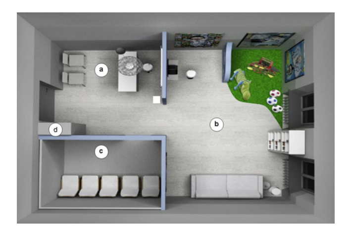
Fig. 1. "Salt Clinic". 3D design: reception/welcome area (a); waiting room with children's recreation area (b); "Aerosal<sup>®</sup>" halotherapy room (c). ENT Care Unit (d). Cabinet containing the Dry Salt Aerosol Generator – University General Hospital – Bari (Italy).

The room environment is not contaminated with pathogenic microorganisms (as certified by SAS 90 to measurements). Patients can settle into comfortable chairs inside the room where the dry salt aerosol is blown through a PVC pipe (described below). A centrifugal extractor fan (air flow rate 90 m³/h), placed on the side opposite to the PVC pipe ensures a number of complete changes of air in full compliance with requirements in terms of CO<sub>2</sub> ppm values, i.e. <750 ppm. Also temperature and humidity are kept at constant values ranging between 20 °C and 24 °C and 44% and 60%, respectively (TESTO 435-4 ^{\tiny (B)} Digital Multimeter measurements).