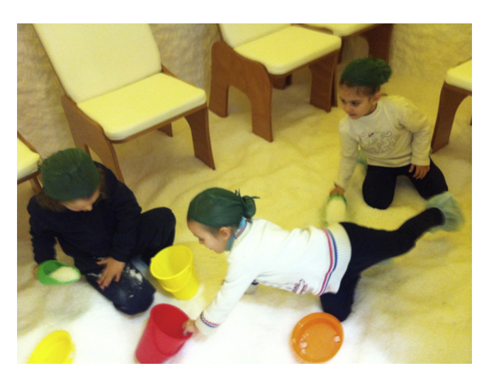
Fig. 2. "Aerosal" Haloterapy Salt Room where children are always highly compliant as they consider treatment sessions as opportunities for play and recreation. ENT Care Unit-University General Hospital – Bari (Italy).

After collection of medical history, all the patients underwent clinical and instrumental exams as follows: ENT visit with inspection of the oropharyngeal tract and tonsillar hypertrophy staging (0^{\circ}-4^{\circ})[27] , flexible fiberscope nasal endoscopy (ENT 2000